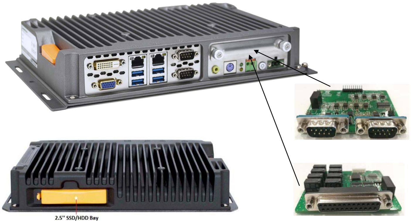
2.5" SSD/HDD Bay

Model: MPCX-67-3855U / MPCX-67-7200U Intel 7th Generation Core™ i3/i5/i7 Modular Fanless Box PC